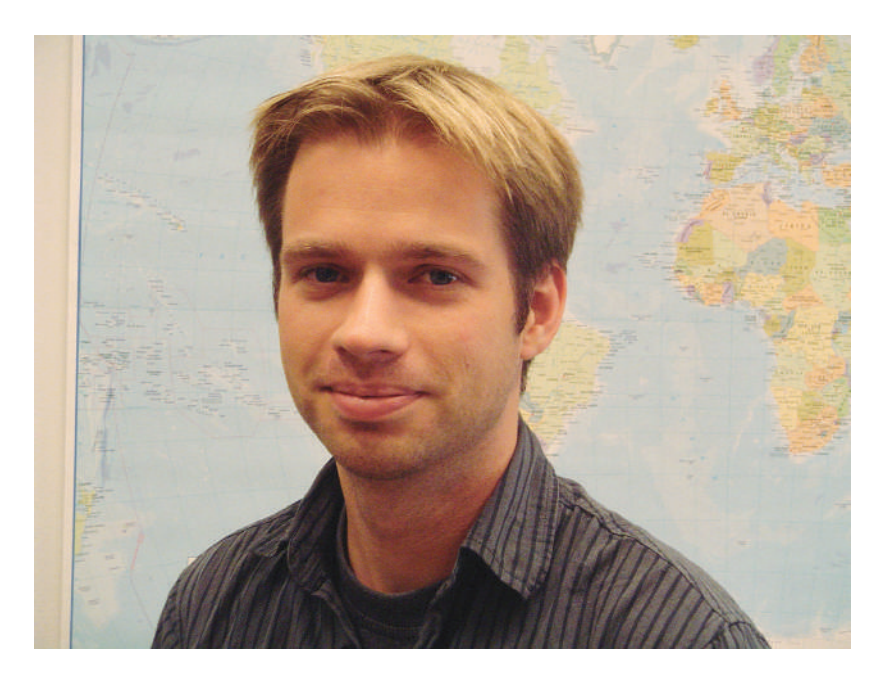
Frank van Tubergen, Professor at the Department of Sociology at Utrecht University

have more incentives to retain their mother tongue and make fewer investments in learning the host language, which in turn limits their labor market prospects. Furthermore, larger groups are seen as more threatening by ethnic majority members, resulting in the higher salience of the "bigger" ethnic groups in media, ultimately resulting in stronger discrimination by ethnic-majority members. Smaller ethnic-minority groups learn the official language faster, mix with majority members more often, and hence "integrate" more easily.