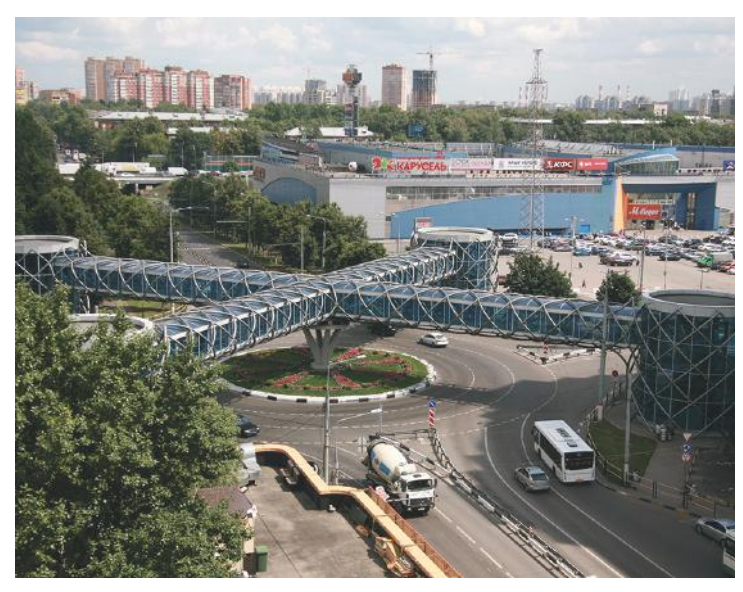
© 2015 Городской округ Химки Московской области

During this period of intense economic growth cities began to compete to attract investments, and Khimki became one of the most suc-